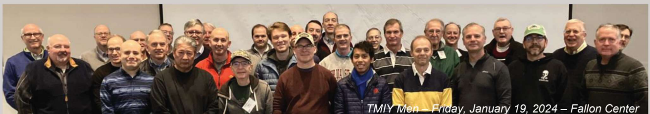
TMIY Men – Friday, January 19, 2024 – Fallon Center

Friday mornings in the Fallon Center, 6:00-7:30 AM