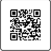
Donate to SVDP Mt. Holly

jelly, soup, pasta sides & shelf stable milk Thank you for your continued support. If you would like to make a monetary donation, please make checks payable to: Society of St. Vincent de Paul Or scan our QR code for PayPal.