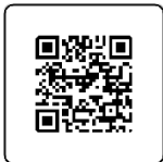
Donate to SVdP Mt. Holly

If you would like to make a monetary donation, please make checks payable to: Society of St. Vincent de Paul Or scan our QR code for PayPal.