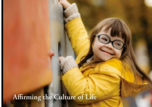
Affirming the Culture of Life