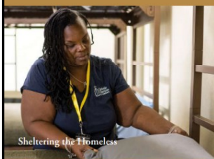
Sheltering the Homeless

2023 BISHOP'S SERVICES APPEAL Supporting the Works of Christ DIOCESE OF LAFAYETTE LOUISIANA