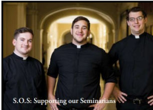
S.O.S: Supporting our Seminarians

This weekend we will have a collection to kickoff 2023 Bishop's Services Appeal to support the works of Christ in our Diocese. Envelopes are placed in the pews for your convenience. Please help support Seminarians and Vocations, Food and Shelter Ministries of CCA, Communications Outreach and Ministries & Direct Services.