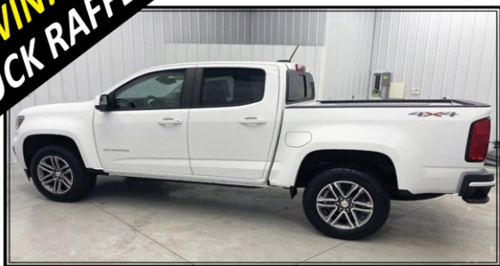
Example Photo - Colors, etc may change