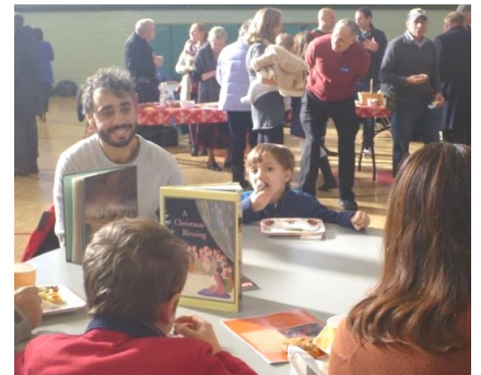
Fun and treats at Sacred Heart's Advent Party last Sunday, December 8. More photos on the next page!