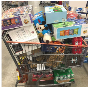
It takes a lot of food to feed folks at a 9th Grade Confirmation retreat, at Sunday morning coffee, and at an Advent party!