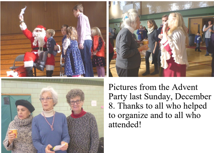
Pictures from the Advent Party last Sunday, December 8. Thanks to all who helped to organize and to all who attended!