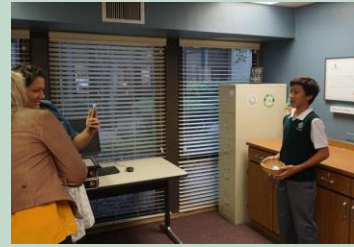
4th Grade Cardboard Challenge:

So come early, stay late, and be loud as we celebrate Homecoming 2017 and cheer on your LIONS to victory!!