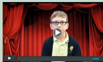
"Lowdown from the Lion's Lair" - Week of 10/9/17