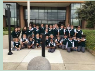
PK3 Community Helpers: