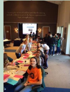
Sept. Service Project: