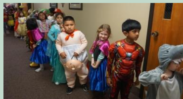
Living Saints Museum: