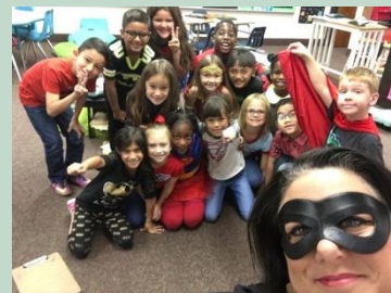
ECE Halloween Parade: