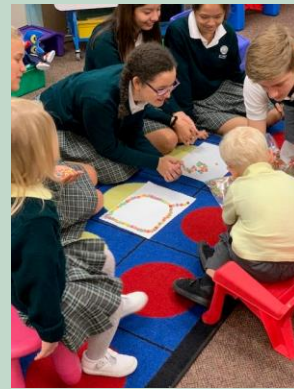
Auction B-day Party: