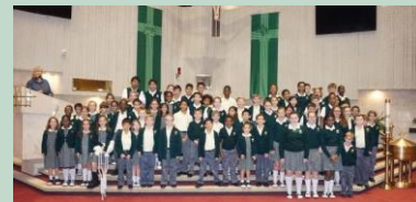
8th Grade @ Make-A-Wish: