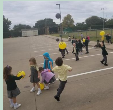
Red Ribbon Week: