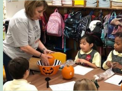
1st Grade STEM:

St. Mark Catholic School | 1201 Alma Drive, Plano, TX 75075 www.stmcs.net | (972) 578-0610