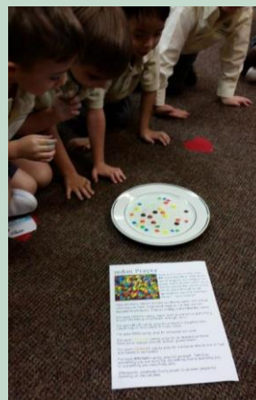
PK3 "I" Week:

Pope Francis' Monthly Prayer Intention: In addition to your prayers for our St. Mark