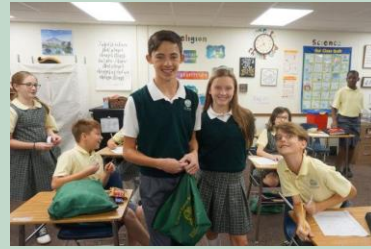
ASP Fair Day:

Now we not only gear up for our October collection, but it's also official submission time! Please turn in any Box Tops you have collected by October 24. The totals for October will be added to those in September to determine which grade brought in the most Box Tops per student. There will be a prize for the grade with the highest average. Please carefully cut out unexpired Box Tops from participating brands; place in a Ziploc (which conveniently has Box Tops!) or envelope; clearly write your child's grade/teacher on it; and turn them in to your child's teacher by October 24. Box Tops submitted without grade/teacher on them will count towards our overall goal but we will not be able to keep track of them for the competition. Each Box Top submitted earns $.10 for St. Mark. Click here for details . For more information, please contact Melissa King or Sharon Mattis .