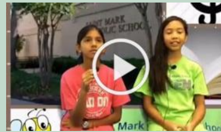
Lowdown from the Lion's Lair Week of 11-5-18

View this week's edition from the News Broadcast Club: