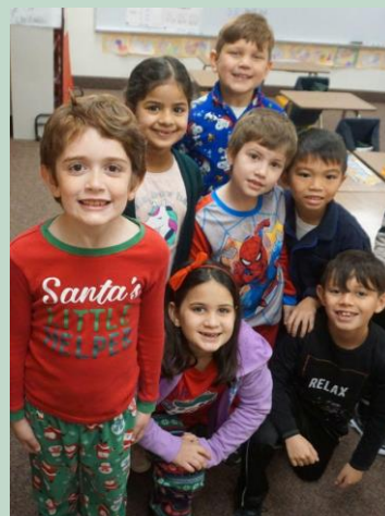
Staff Wacky Tacky Christmas: