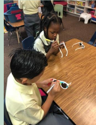
2nd Grade Solar Ovens: