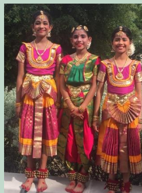
PK3 Watermelon Party: