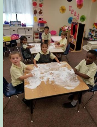
1st Grade Volcanoes: