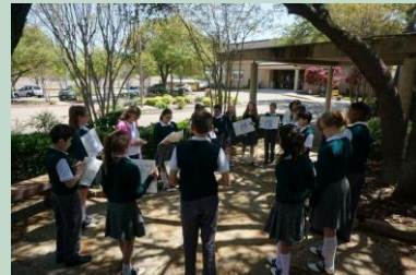
PK Wacky Wednesday: