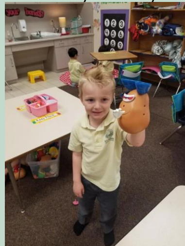
PK Peeps Taste Test: