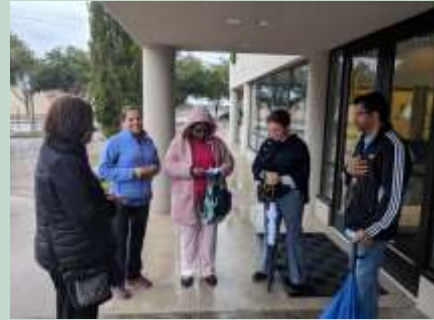
Girl Scout Silver Award:

YOUR SAFE ENVIRONMENT TRAINING MUST BE CURRENT.