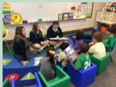
Ash Wednesday Project: