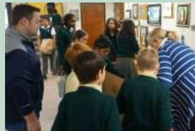
7th Grade Books: