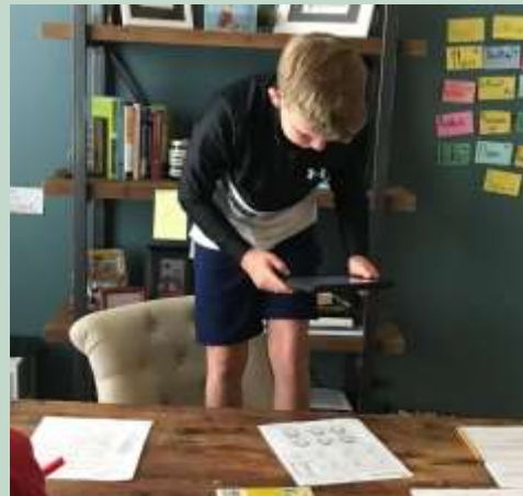
Real Life Graphing: