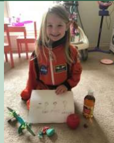
Teacher Appreciation Day:

For more, check out the Kidventure digital brochure, visit www.kidventure.com/dallas-summer-camp , or call (214) 303-9789.