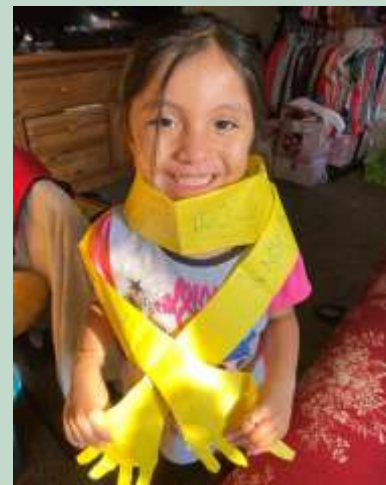
"A" Week in PK4: