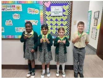
Service From the Heart