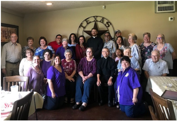
Clergy Appreciation luncheon hosted by the Catholic Daughters of the Americas, Court 2134, Immaculate Mary—Angleton / Danbury. The dinner was held Sunday, May 26th at Smithhart's for the priests and deacons in appreciation for their vocations.