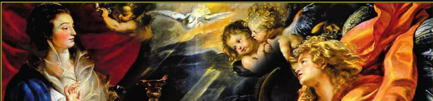
The Annunciation (1610) - Peter Paul Rubens