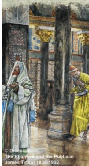
The Pharisee and the Publican James Tissot 1836-1902