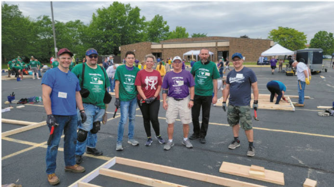
Last year's Home Build