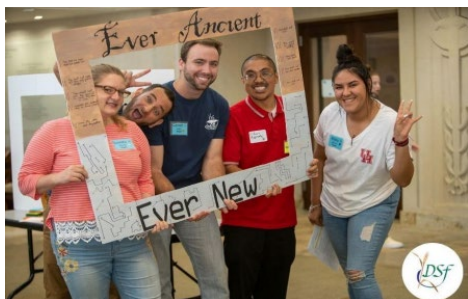
DSF SPOTLIGHT: YOUNG ADULTS & CAMPUS MINISTRY ARCHGH.ORG/DSF

2023 Parish Goal..... $ 26,000.00 2023 Total Paid (activity thru 7/03/2023) $ 17,335.00 Difference Goal vs. Paid $ 8,665.00