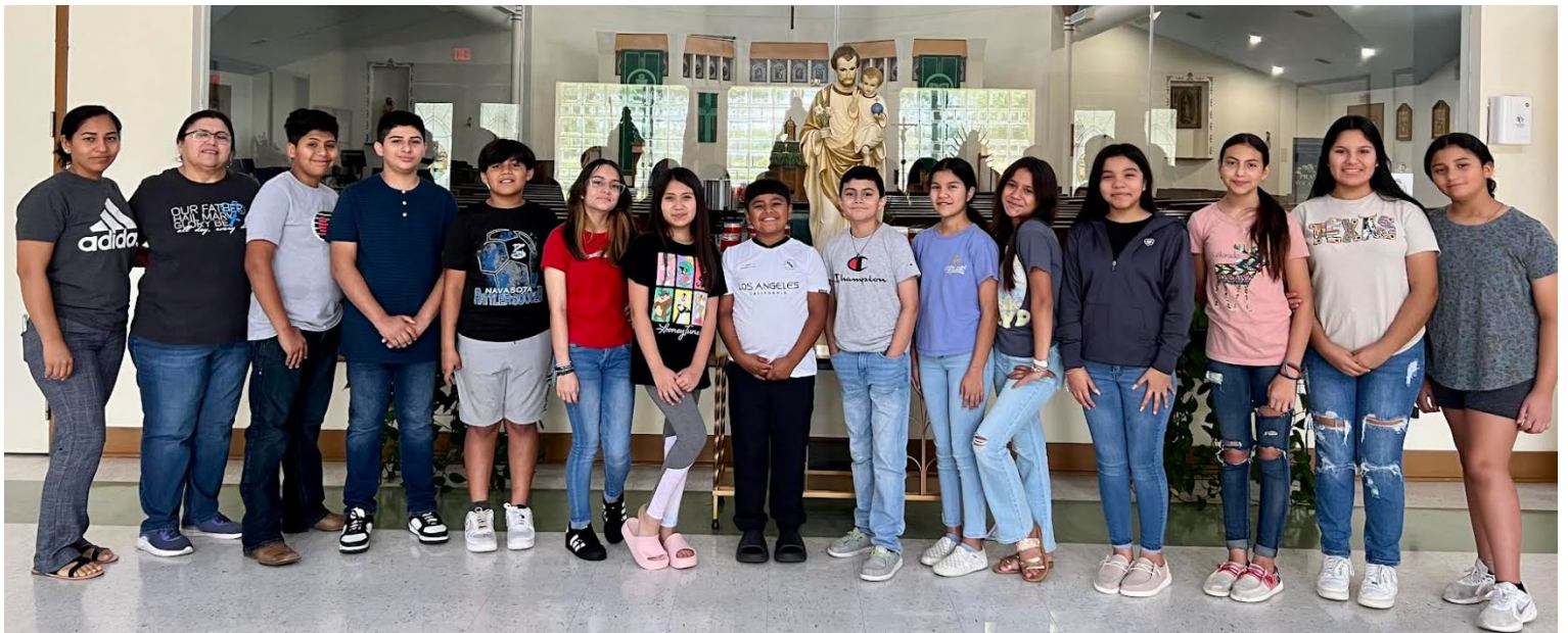
ALTAR SERVERS AT CHRIST OUR LIGHT CATHOLIC CHURCH