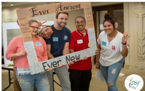
DSF SPOTLIGHT: YOUNG ADULTS & CAMPUS MINISTRY ARCHGH.ORG/DSF

2023 Parish Goal..... $ 26,000.00 2023 Total Paid (activity thru 08/01/23 ) $ 17,710.00 Difference Goal vs. Paid $ 8,290.00