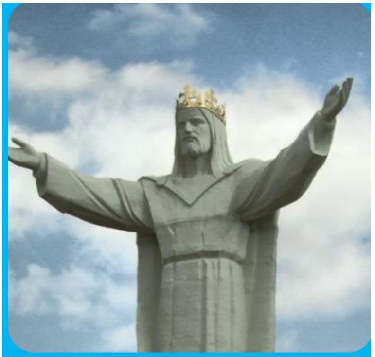
"Christ the King" in Poland

These two things came together in people’s minds, as Wikipedia explains: “Supposedly, cooks, wives and their servants would go to church, hear the words ‘Stir up, we beseech thee, O Lord...’, and be reminded, by association of ideas, that it was about time to start stirring up the puddings for Christmas.”