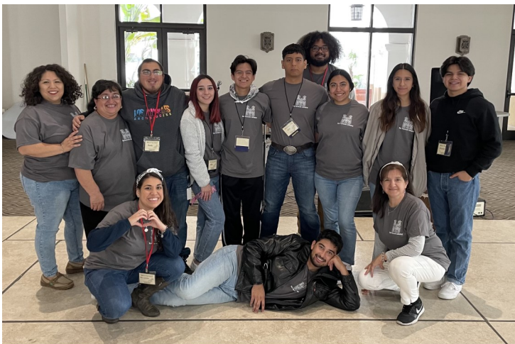
San Fernando Cathedral Youth Retreat Team Leaders