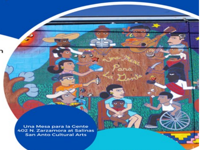
Una Mesa para la Gente 402 N. Zarzamora at Salinas San Anto Cultural Arts