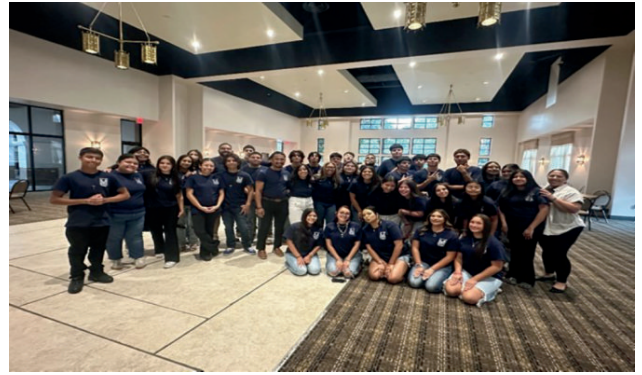
Teen ACTS Retreatants & Team July 24- 27, 2025