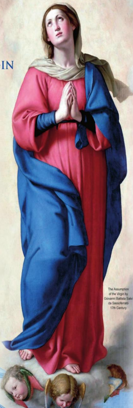
The Assumption of the Virgin by Giovanni Battista Salvi da Sassoferrato 17th Century