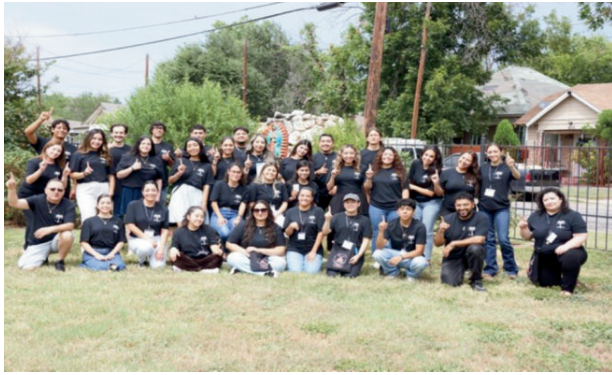
Jornadas Retreatants & Team July 24- 27, 2025