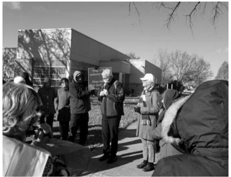
Bishop Donald Hying at the Closing Prayer Vigil of the 40 Days For Life Campaign at Planned Parenthood In Madison on November 1st.

SCRIP - is available to purchase following Thursday morning Masses in Lodi, or call the Parish Office (592-5711 ext. 2) for an appointment to stop by to purchase Scrip.