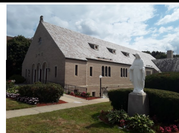
Our Lady of Good Counsel Church 237 Sea Street