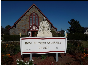
Most Blessed Sacrament Church 1015 Sea Street