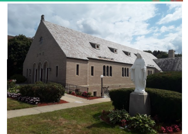
Our Lady of Good Counsel Church 237 Sea Street