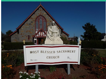
Most Blessed Sacrament Church 1015 Sea Street