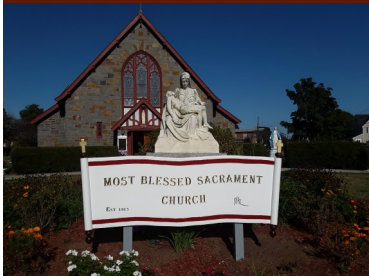
Most Blessed Sacrament Church 1015 Sea Street

Then he opened their minds to understand the Scriptures. And he said to them, "Thus it is written that the Christ would suffer and rise from the dead on the third day." - Lk 24:45-46