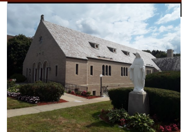
Our Lady of Good Counsel Church 237 Sea Street