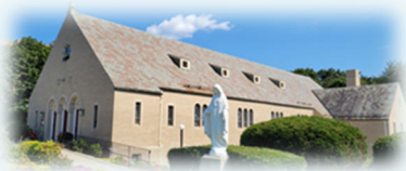
OUR LADY OF GOOD COUNSEL 227 Sea Street