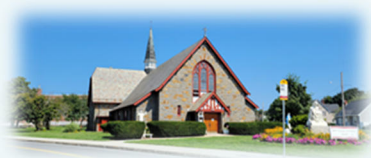
MOST BLESSED SACRAMENT 1015 Sea Street

Masses .....OLGC Mon-Fri 9:00 AM Holy Hour (Divine Mercy, Adoration, Rosary)..... OLGC Mon-Fri 8:00 AM Holy Hour (Adoration, Rosary).....OLGC Wed 7:00 PM