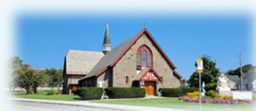
MOST BLESSED SACRAMENT 1015 Sea Street