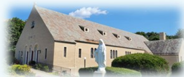
OUR LADY OF GOOD COUNSEL 227 Sea Street

We pray for children who are suffering, especially those who are homeless, orphans, and victims of war; may they be guaranteed access to education and the opportunity to experience family affection.