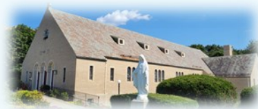
OUR LADY OF GOOD COUNSEL 227 Sea Street

We pray that parishes, placing communion at the center, may increasingly become communities of faith, fraternity and welcome towards those most in need.