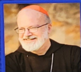
Cardinal Sean Patrick O'Malley OFM Cap. Archbishop of Boston