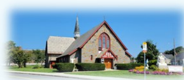
MOST BLESSED SACRAMENT 1015 Sea Street