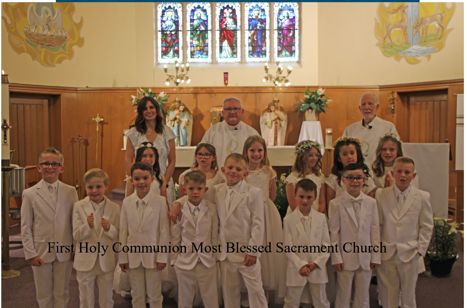
First Holy Communion Most Blessed Sacrament Church