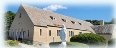
OUR LADY OF GOOD COUNSEL 227 Sea Street