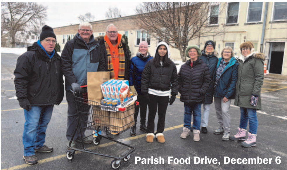
Parish Food Drive, December 6