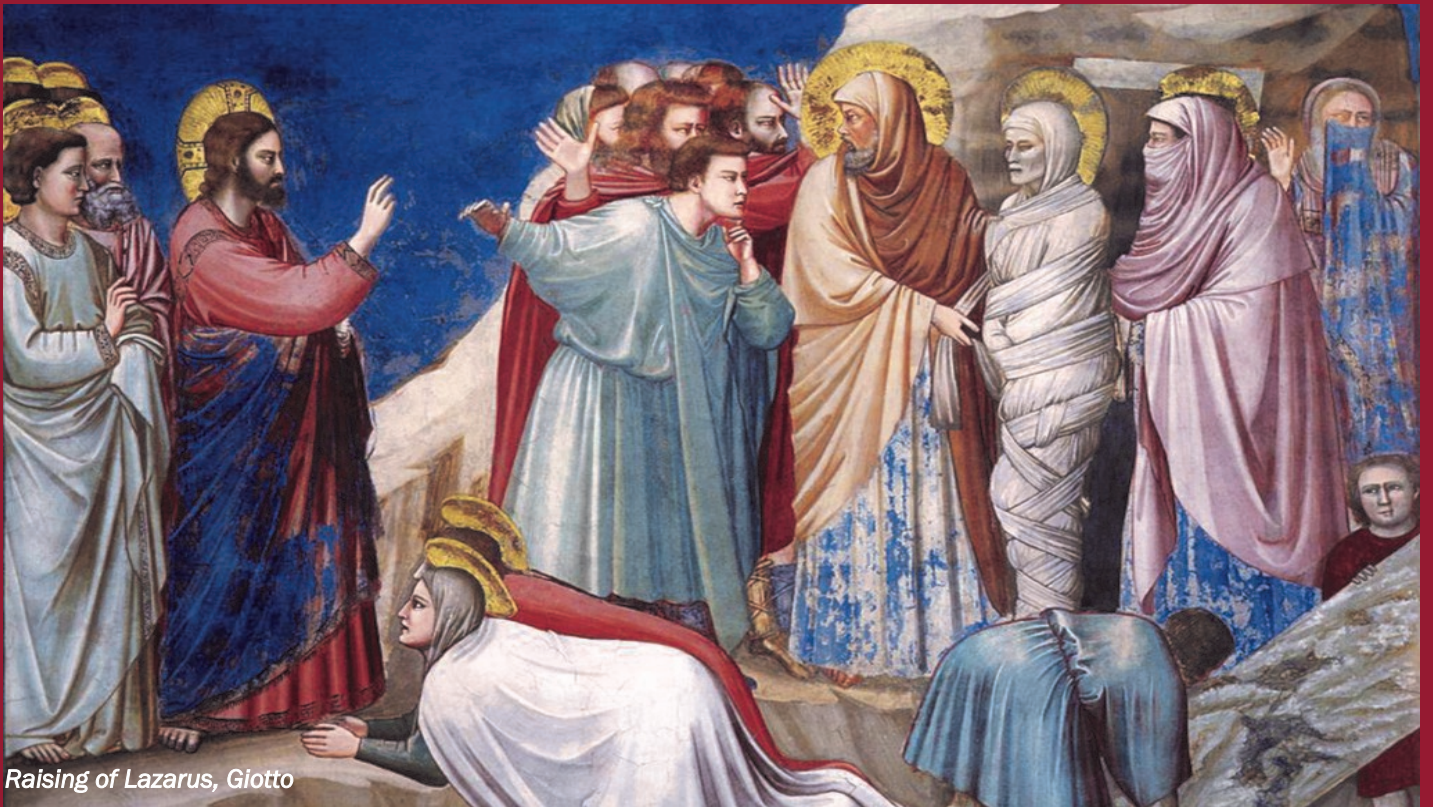
Raising of Lazarus, Giotto

17951 Dixie Highway, Homewood, IL 60430 (708) 798-0622 † rectory@sjnhomewood.org † sjnhomewood.org