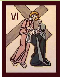
A woman, Veronica, wipes Jesus' face.