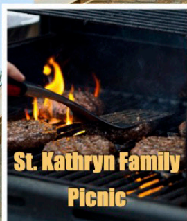
St. Kathryn Family Picnic