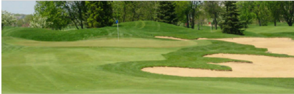
SAINT MARY OF VERNON PARISH GOLF OUTING JUNE 24, 2018