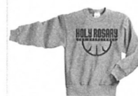
Port & Company Youth Core Fleece Crewneck Sweatshirt