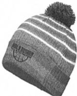
Holloway Spirit Pom Beanie

Online Store Deadline: Sunday December 17th, 2023 (11:59pm EST)