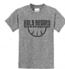
Port & Company Youth Core Blend Tee