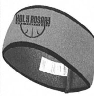
Augusta Sportswear Chill Fleece 2.0 Headband