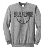
Port & Company Essential Fleece Crewneck Sweatshirt