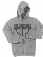
Port & Company Essential Fleece Pullover Hooded Sweatshirt