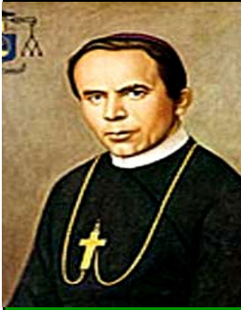
St John Neumann, C. S. S. R. 1811-1860