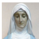
St. Anne, Pray for Us!