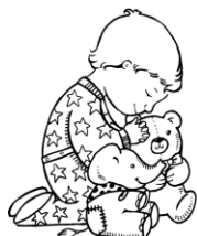
God Hears and Answers Prayer

Do you have a sense that something is missing in your life? Are you ready to grow spiritually? Are you hungry to learn more? Wherever you are in your journey, Best Lent Ever from Dynamic Catholic wants to meet you right there and walk with you, helping you discover God and the best way to live. Sign up for Best Lent Ever at www.dynamiccatholic.com .